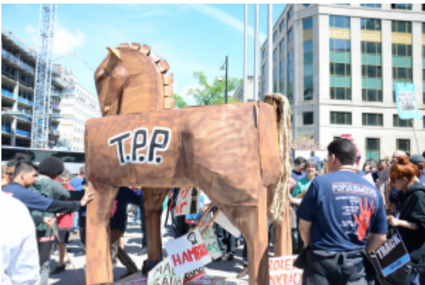
“Stop Fast Track” rally in Washington D.C., April 2015.

From the American strategic standpoint, however, this would represent the ultimate failure of its divide-and-rule policy in Eurasia, and it's for this institutional reason why the US is so adamant about pursuing the Transatlantic Trade and Investment Partnership (TTIP) with the EU. In the event that this neo-imperialist proposal ever enters into force, then the US would have the dominant say in deciding whether its junior EU 'partner' is allowed to continue its existing free trade negotiations with Japan and India . More likely than not, it would indefinitely freeze these already-stalled processes in order to consolidate its economic control over the bloc, and only after it exercises indisputable control over it will Washington allow the talks to proceed. By that point, the goal would be to link TTIP and the TPP (which will be expanded upon shortly, but whose Asian component will be led by Japan ) together to make the US the institutionally essential actor between them, and then complete the unipolar-dominated economic envelopment of Eurasia by bringing India into the mix to some capacity.