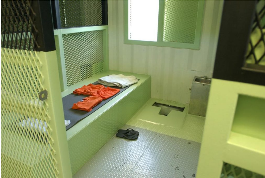
The cell of a non-compliant prisoner at Camp Delta, Naval Station Guantánamo Bay, Cuba.

“One has no blessing in life if one is deprived from certain joys.”