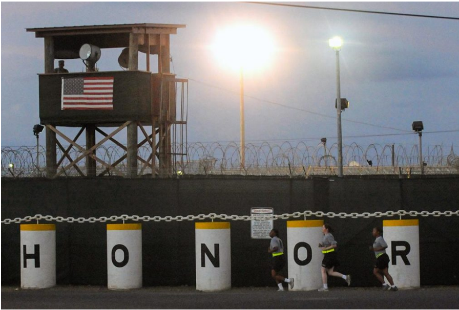
Honorbound sign at Joint Task Force Guantanamo's Camp Delta.

It is worth taking an in-depth, closer look at his death, including actions taken in the days leading up to his death by doctors, nurses and guards. But this remains a provisional narrative, as the full story is still pointedly unknown, blocked on one hand by government censorship and the failure to release all documentation. On the other hand, we do not have access to the scene of his death. We do not have access to the witnesses. They cannot be cross-examined. The key witness, Al Hanashi himself, is dead.