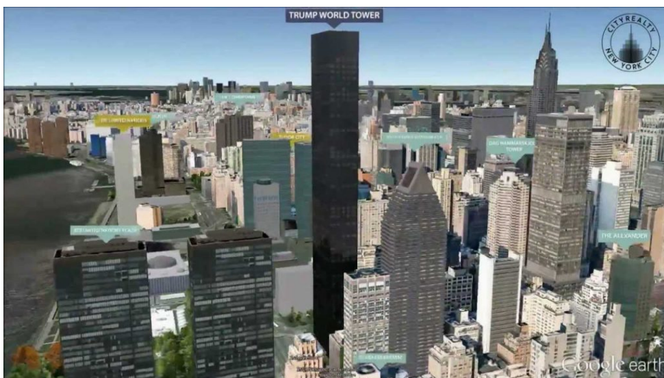
Trump World Tower Manhattan

The distance between Seoul and Pyongyang is about 121 miles, less than the distance between the Trump Tower in Manhattan and The Trump Taj Mahal Casino in Atlantic City (131 miles)