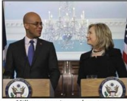
Hillary propping up her stooge Martelly at the State Department