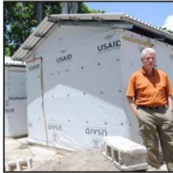
Bill Clinton in front of one of his 6 Billion Dollar Haiti "houses"