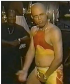
The degenerate Martelly doing the only thing he really knows how to do

-While Bill & Hillary Clinton have been sold to the world as friends of Haiti because they accidentally spent their honeymoon there, the record, as you will see, is completely different.