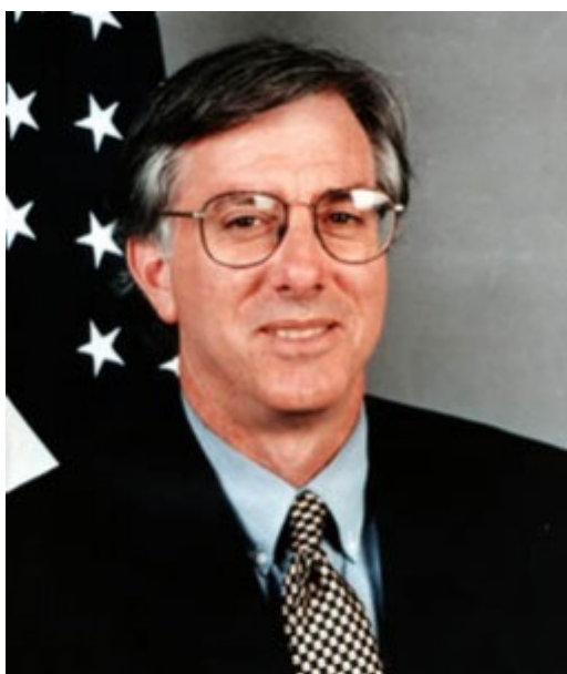
Image: Dennis Ross, who has served as a senior U.S. emissary in the Middle East.

Channeling the desires of right-wing Israeli Prime Minister Benjamin Netanyahu, Ross called for the United States to yoke itself to the regional interests of Israel, Saudi Arabia and other members of the Gulf Cooperation Council (GCC) in their rivalry against Shiite-led Iran.