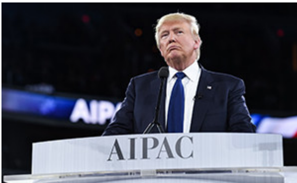
Image: Republican presidential candidate Donald Trump speaking to the AIPAC conference in Washington D.C. on March 21, 2016.

But Trump is not a fan of the "neos." He forthrightly takes on the neocons over the Iraq War and excoriates ex-Secretary of State Clinton for her key role in another "regime change" disaster in Libya. Further, Trump calls for cooperation with Russia and China rather than the neocon-preferred escalation of tensions.