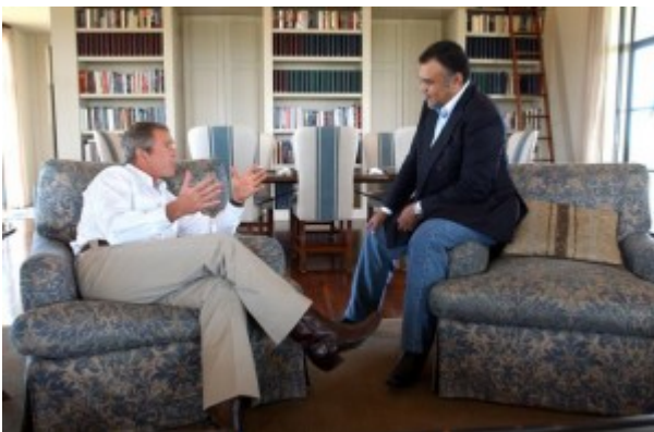
Image: Prince Bandar bin Sultan, then Saudi ambassador to the United States, meeting with President George W. Bush in Crawford, Texas, on Aug. 27, 2002.

The main thing that the zombie "neos" have going for them is that the vast majority of Very Important People in Official Washington have embraced these concepts and have achieved money and fame as a result. These VIPs are no more likely to renounce their fat salaries and overblown influence than the favored courtiers of a King or Queen would side with the unwashed rabble.