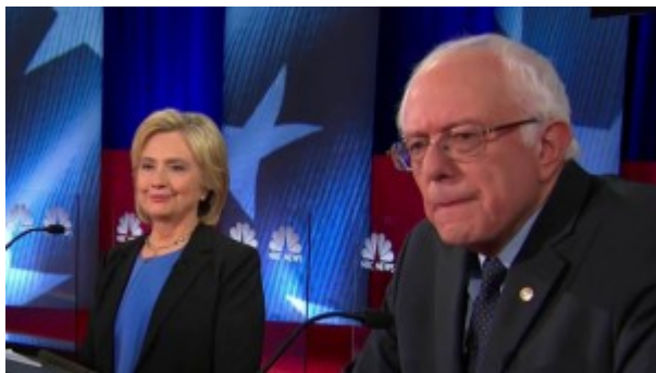
Image: Former Secretary of State Hillary Clinton and Sen. Bernie Sanders.

Not so much for the “losers,” those average citizens who have seen the Great American Middle Class hollowed out over the past few decades, watched America’s public infrastructure decay, and worried about their sons and daughters being sent off to fight unnecessary, perpetual and futile wars.