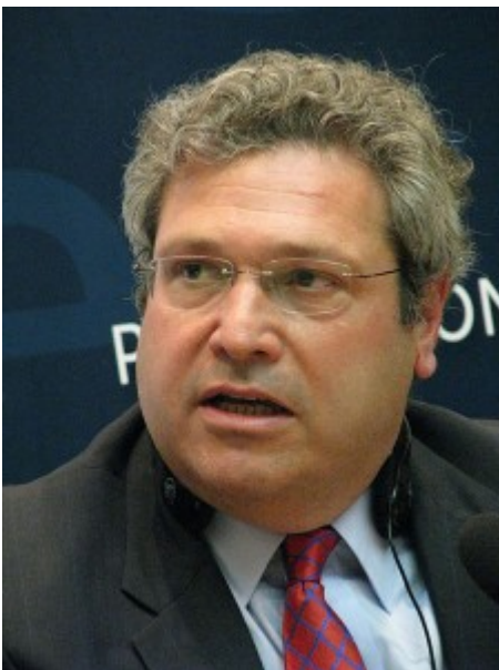
Image: Prominent neocon intellectual Robert Kagan.

But as arch-neocon Robert Kagan, who has recast himself as a "liberal interventionist," told The New York Times in 2014, "I feel comfortable with her on foreign policy. If she pursues a policy which we think she will pursue it's something that might have been called neocon, but clearly her supporters are not going to call it that; they are going to call it something else."