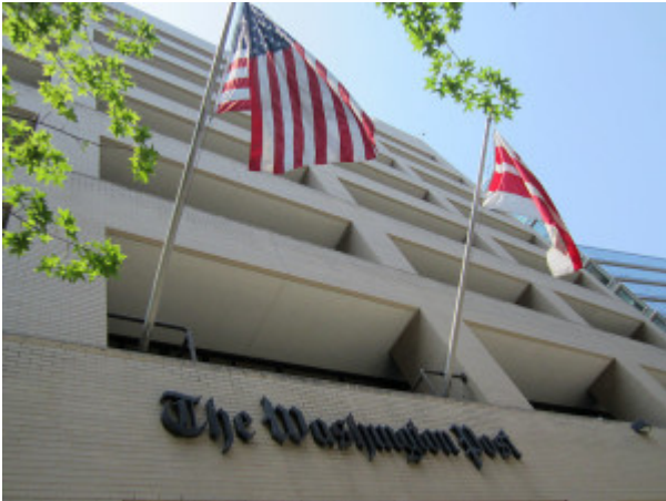
Image: The Washington Post building.

“The aim is to understand the scope and intent of the Russian campaign, which incorporates cyber-tools to hack systems used in the political process, enhancing Russia’s ability to spread disinformation. ... A Russian influence operation in the United States ‘is something we’re looking very closely at,’ said one senior intelligence official,”