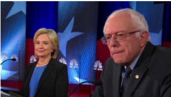
Image: Former Secretary of State Hillary Clinton and Sen. Bernie Sanders.

The usual rule of thumb for journalists is to accept and verify information regardless of where it comes from. While occasionally you get a selfless leaker, it’s more common to get leaks from interested parties seeking to undermine their rivals. We see that in legal proceedings when lawyers supply documents helpful to their cases and in political contests when campaigns dig up dirt on their opponents.