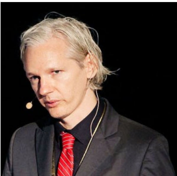
Image: WikiLeaks founder Julian Assange at a media conference in Copenhagen, Denmark.