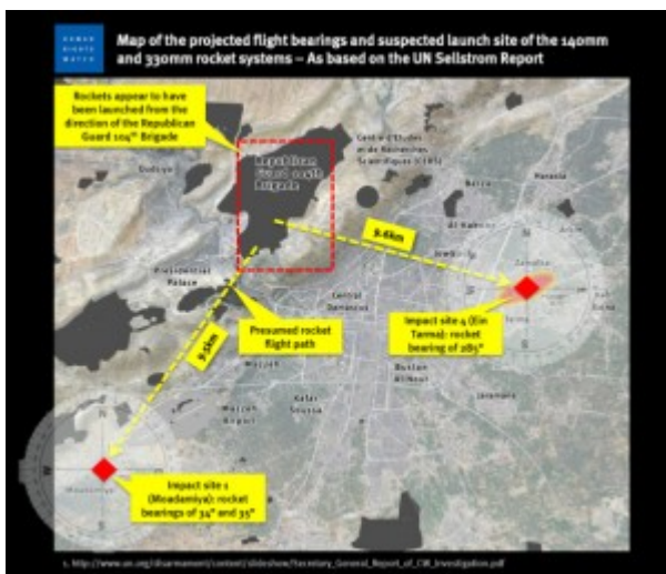
Image: The controversial map developed by Human Rights Watch and embraced by the New York Times, supposedly showing the flight paths of two missiles from the Aug. 21 Sarin attack intersecting at a Syrian military base.

Most memorably, in 2002, the Times pushed disinformation about the Iraqi government reconstituting its nuclear weapons program, a lie that was then cited by Vice President Dick Cheney and other senior officials to help stampede the American people behind the 2003 invasion of Iraq.