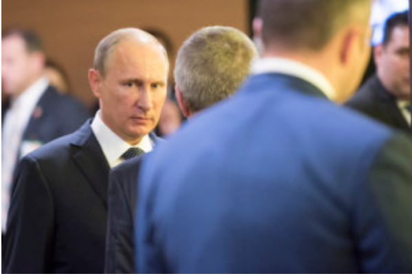
Image: Russian President Vladimir Putin, following his address to the UN General Assembly on Sept. 28, 2015.