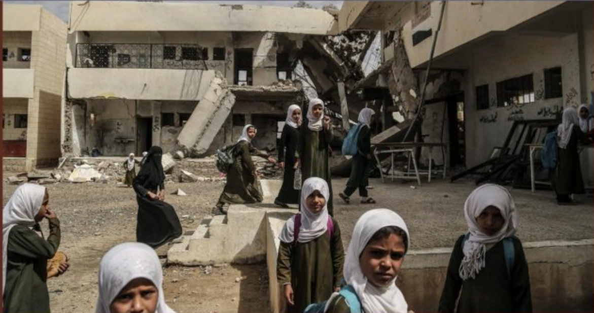
Students of al-Munadhil school for girls during a break. The school has been bombed by the Saudi-led coalition during raids in Saada.

Academic research published in Guardian establishes that "more than one-third of all Saudi-led air raids on Yemen have hit civilian sites, such as school buildings, hospitals, markets, mosques and economic infrastructure"