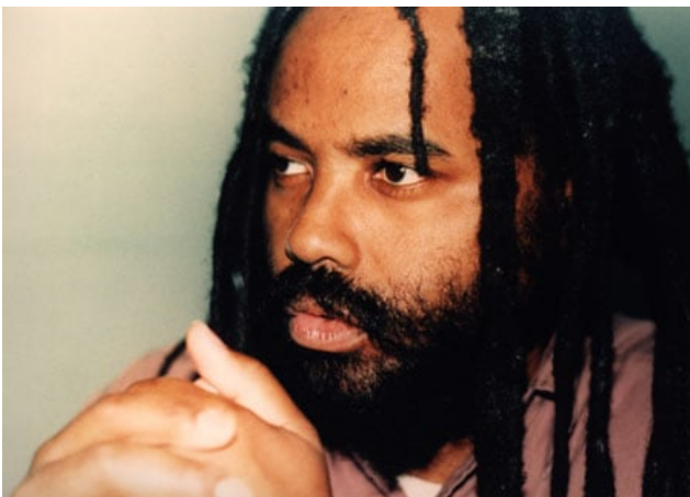
The Panthers focus on the evils of the prison