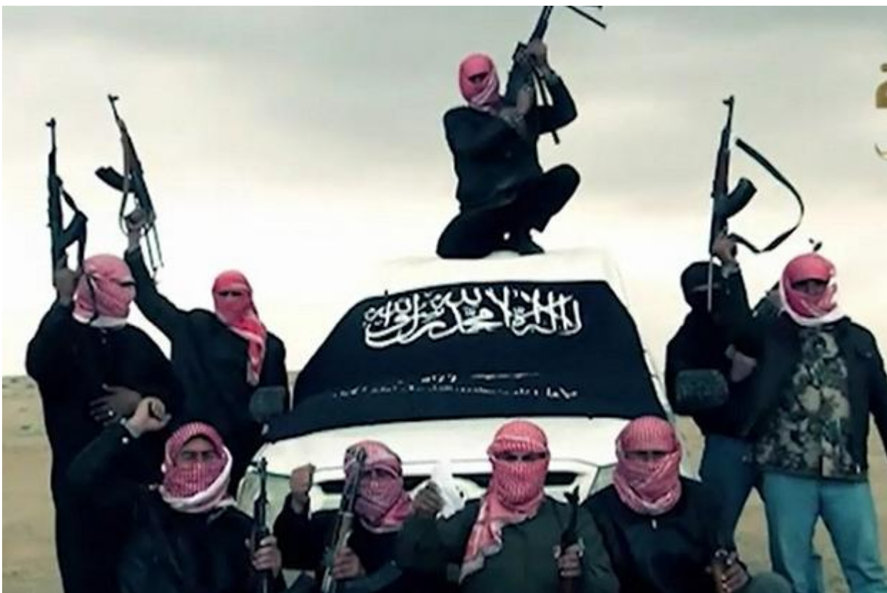
al-Nusra-Front supported by US-NATO-Israel

Western media now claim that Aleppo's citizens are under threat from the Syrian Army, while Syrian sources show civilians, reeling from constant mortar attacks, demanding that the Army roots out all terrorist groups.